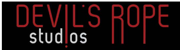
Devil's Rope Studios